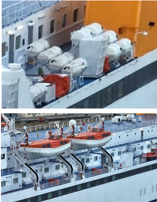
Figure 7 Inspection of safety equipment and cabins