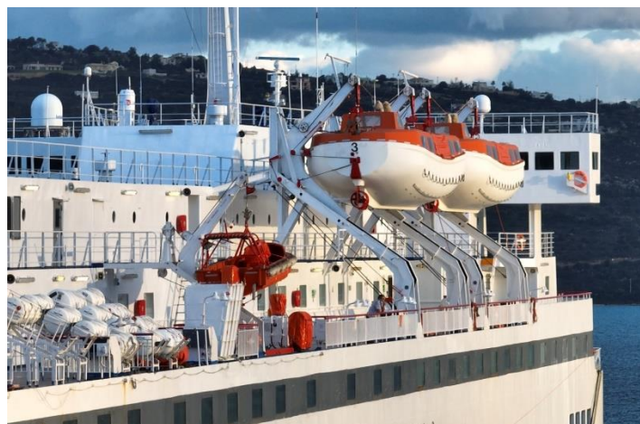
Figure 4; Inspection of upper deck