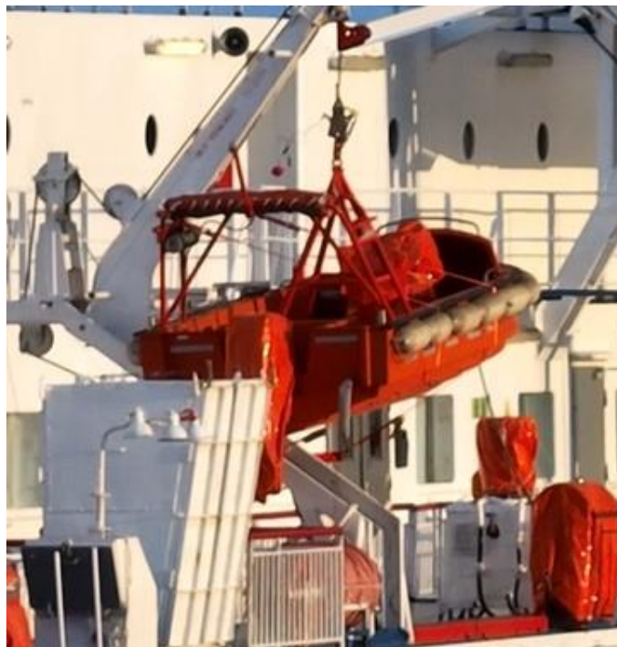
Figure 1; Inspection of lifeboats and equipment