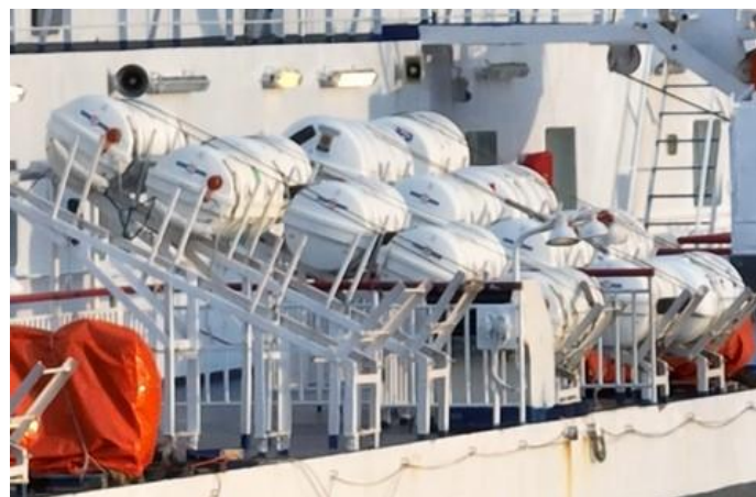
Figure 3; Inspection of life rafts and buoys