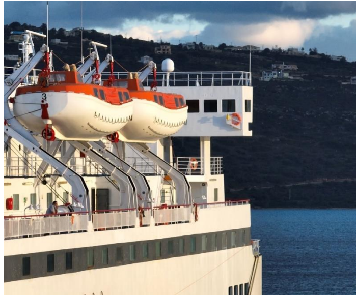
Figure 2; Inspection of lifeboats and upper hull